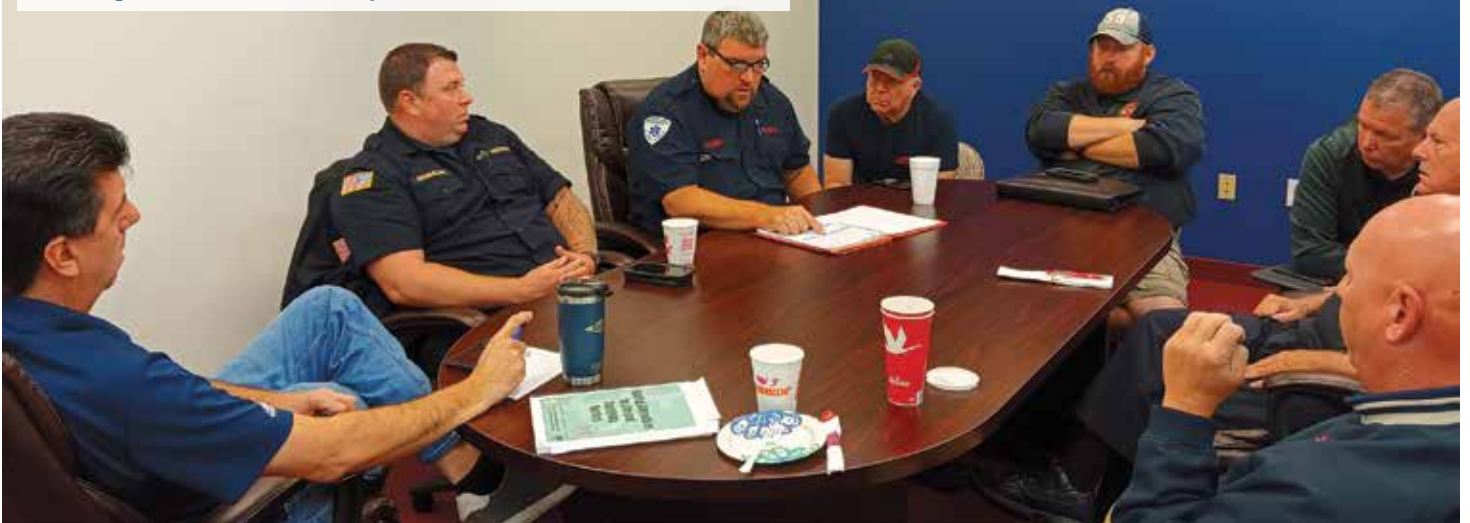
I continue to meet with the police, EMS, and fire chiefs to discuss their needs and any challenges they are facing. We will continue to work together to ensure that everyone in our communities receives the exceptional service that they deserve.