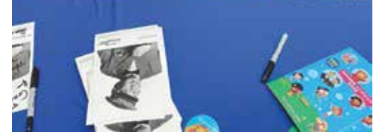
David Newell, who many of you may remember as Mr. McFeely, the delivery man on Mister Rogers' Neighborhood, came to Harrisburg. I remembered all the days that I spent watching him on the show and it made me feel like a kid again!