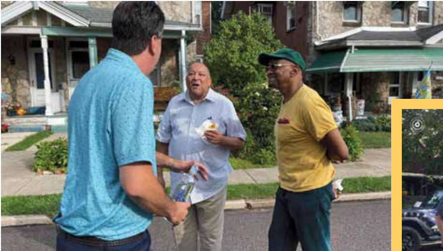
National Night Out was celebrated in Royersford, Pottstown, and West Pottsgrove. It is so good to see so many people attend this fun and free family event!