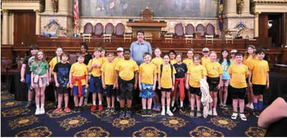
I was happy to welcome students from Royersford Elementary to Harrisburg this Spring. They were able to get a tour of the Capitol, and I was able to take them onto the floor of the House!