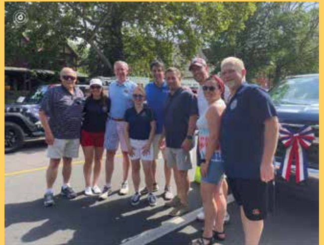
It was another great year for the Pottstown Go Fourth celebration!