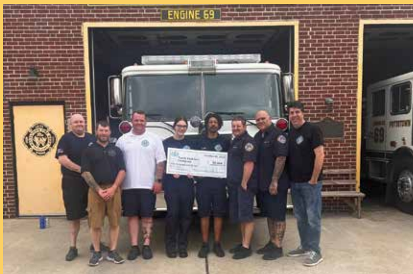
In April, I presented $50,000 in state funding to Pottstown's North End Fire Co. for needed facilities improvements.

The cost for dental hygiene services for adults and children is $20; $15 for senior citizens (55 or older); and free for MCCC students. Sealants with a dentist prescription are $5 per tooth, and x-rays with a dentist prescription are $15. Fees are payable by cash or check at the time services are rendered.